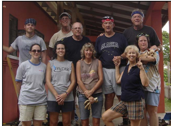
Team Honduras, 2009

Life changing! Those are the only words that can truly describe the experience of being a part of a mission team. The experience of seeing true poverty, through Christ’s eyes, was humbling. Spending time with missionaries who have given everything to serve the Lord was